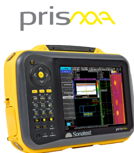
Prisma (IPA or 2TOFD)