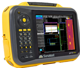
Prisma (IPA or 2TOFD)